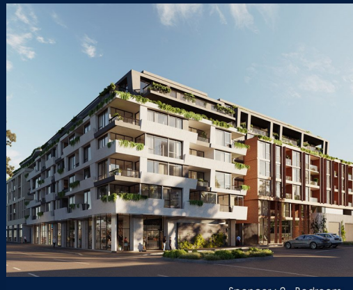
Spencer: 2 - Bedroom