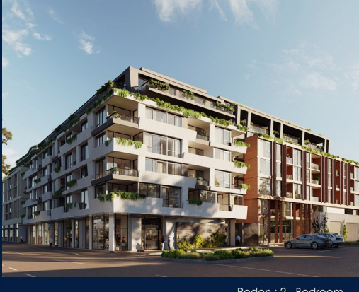
Roden: 2 - Bedroom