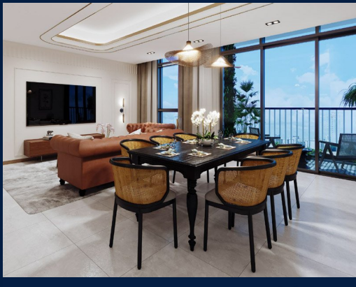
4 - Bedroom